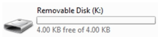
Figure 2: RAM u-disk

When the format is completed, the computer will display the capacity of 4k removable disk.