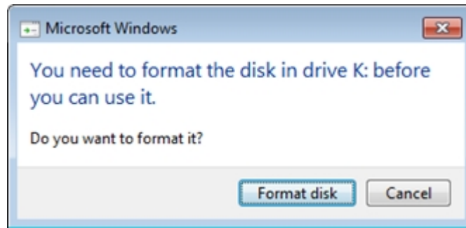
Figure 1: Format the disk

When the format is completed, the computer will display the capacity of 4k removable disk.