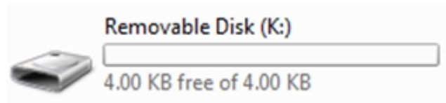
Figure 2: RAM u-disk

When the format is completed, the computer will display the capacity of 4k removable disk.