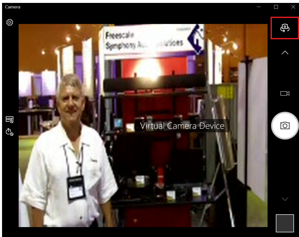
Figure 2: Windows camera test tool

Or use online tool https://webcamtest.com/ , select "Virtual Camera Device".