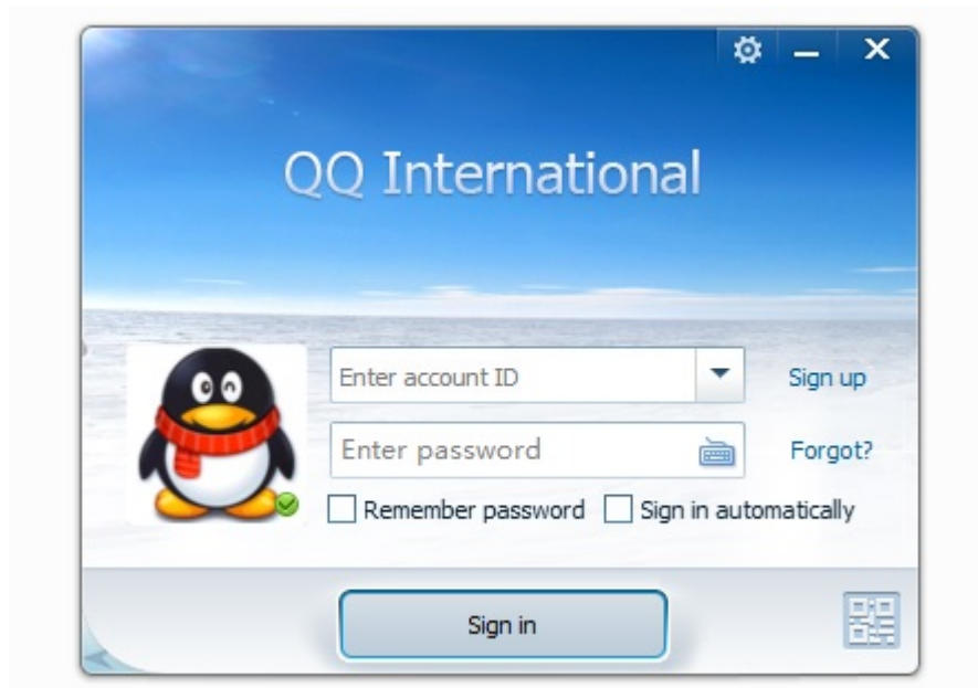
Figure 2: Login the test tool