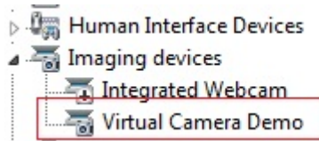
Figure 1: The video device is attached