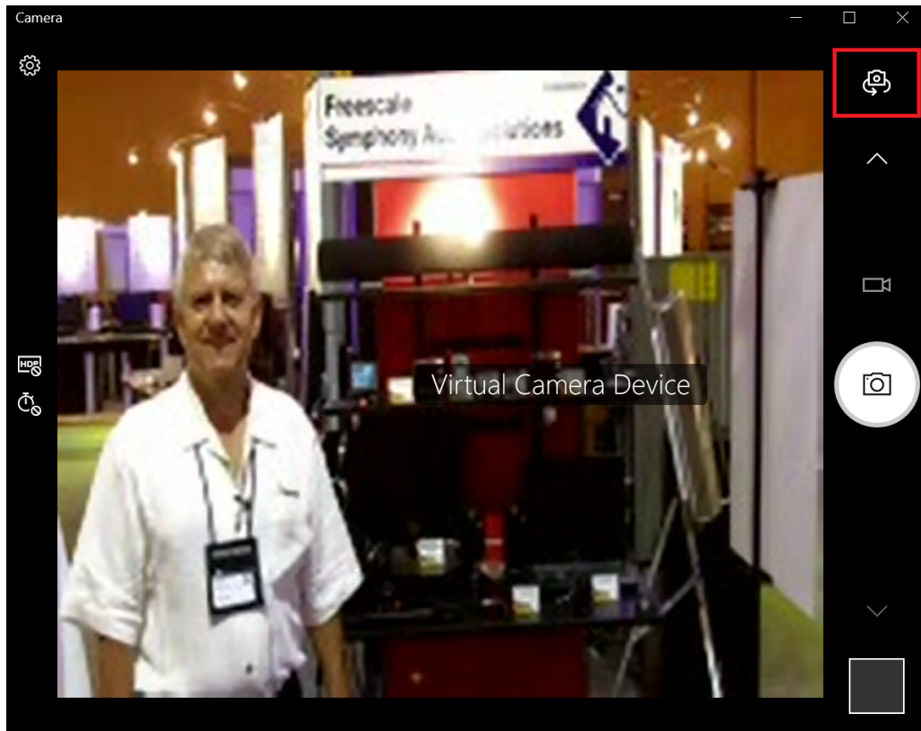
Figure 2: Windows camera test tool

Or use online tool https://webcamtest.com/ , select "Virtual Camera Device".